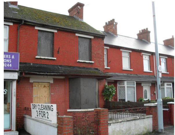
163 York Road

Grove tried to purchase a number of houses in the area that have been derelict for a long time, but in the end we were only able to buy 163 York Road and 6 Keadyville Avenue. A tender to renovate these two houses and our previously unimproved house at 141 Shore Road was also accepted at the end of March.