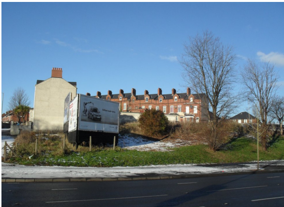
Loughview Terrace site

This development again required considerable work from many people to create a viable scheme on a prominent but awkward site at the corner of Shore Road and Skegoneill Avenue. A tender was accepted at the end of March 2011 to construct the 5 houses and 4 flats.