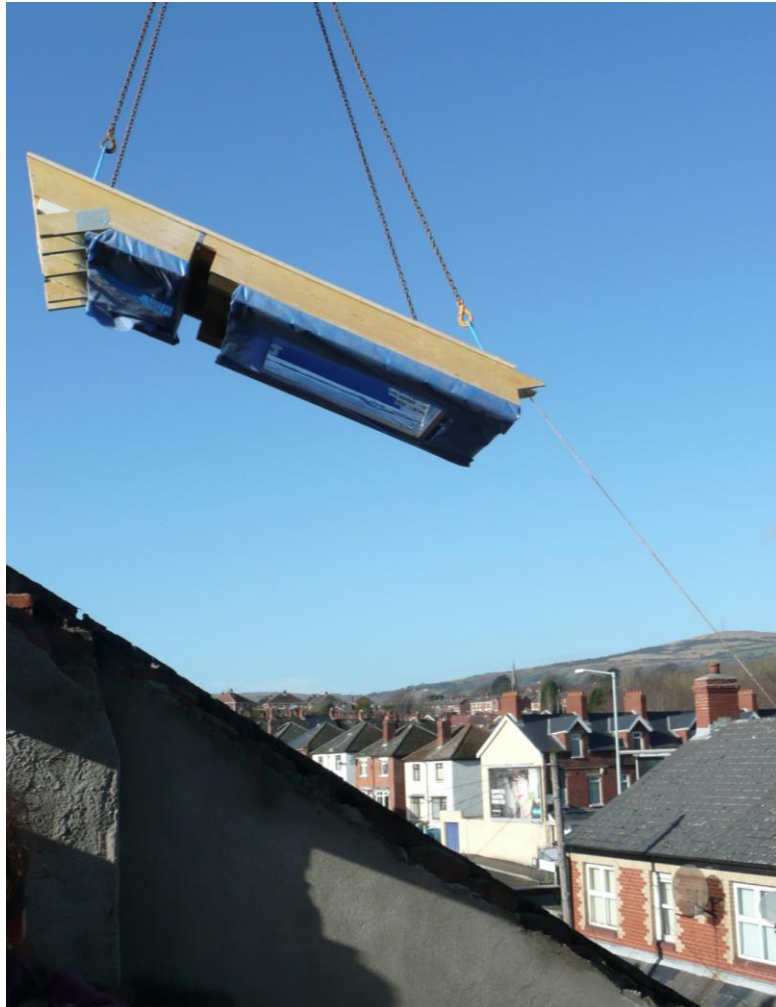
New "retrofit" roof at 9 St Vincent Street

PROVIDING QUALITY AFFORDABLE HOMES IN THE GROVE AREA AND IMPROVING THE STANDARD OF LIFE IN THE COMMUNITY