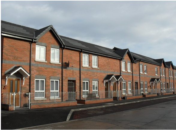
2-20 Ivan Street

The scheme meets Lifetime Homes and Secured by Design standards. It is the first project carried out by Grove to achieve Level 3 of the Code for Sustainable Homes. As part of this it has photovoltaic (PV) panels on the roofs to generate electricity and reduce costs for the tenants.